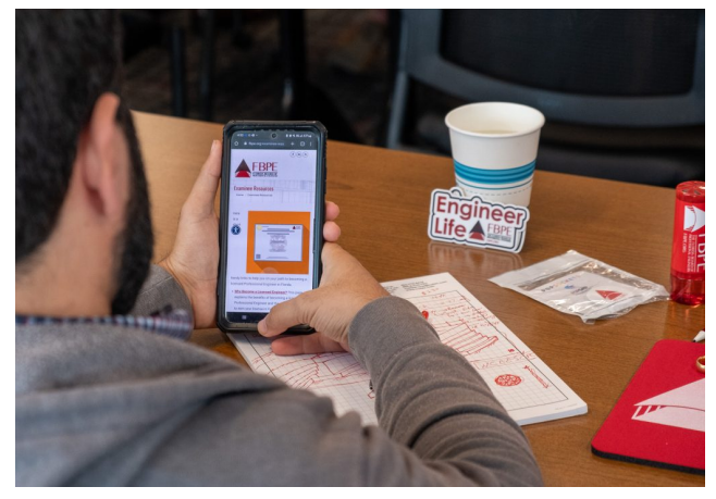
An attendee looks at the FBPE website during a presentation at Kimley-Horn in Orlando.

Engineering exam, the requirements for education and experience, and the steps needed