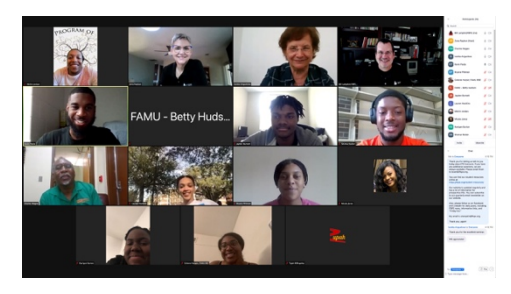
FAMU Biological Systems Engineering club presentation

Information that would otherwise have been handed out to students on USB drives was posted on a new <u>Student</u> <u>Resources</u> page on the FBPE website. That information includes links to pertinent areas of the <u>FBPE website</u> and