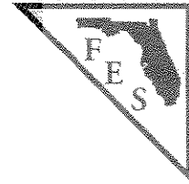
Florida Engineering Society

This guide has been developed by a Task Force of representatives from three professional associations, to provide guidance for both design professional and local code compliance officials, with regard to the interpretation of certain aspects of Florida licensing laws. The following associations contributed to this document: